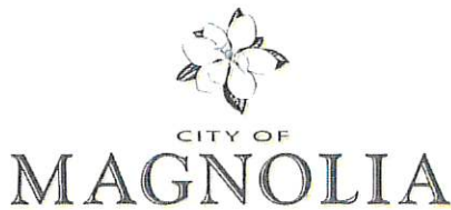
Exhibit A Ord 2023-011